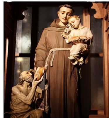
Through the intercession of St. Anthony

WE ENDEAVOR TO SHARE OUR TIME, TALENT AND TREASURE TO PROCLAIM THE GOSPEL OF JESUS CHRIST, AND AS HIS CHURCH, TO GROW IN FAITH AND LOVE, TO ACT IN CHARITY AND TO SERVE ALL OF HIS PEOPLE.